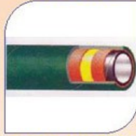
XPL CHEMICAL HOSE