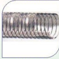
NON - TOXIC STEEL SPIRAL HOSE (TRANSPARENT)