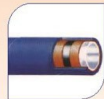
MILK AND VEGETABLE OIL DISCHARGE HOSE